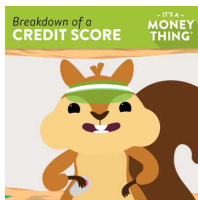
Credit Score Breakdown

Check out these FREE financial literacy videos to help the young people in your life, take steps toward smart money habits.