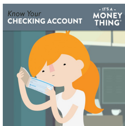
Know Your Checking Account