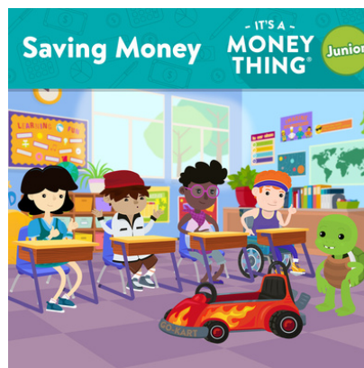
Saving Money Jr. Edition