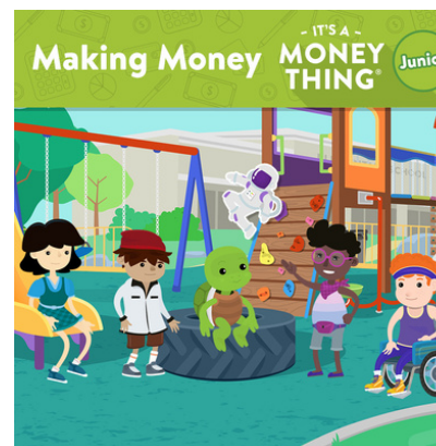
Making Money Jr. Edition