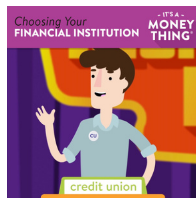
Choosing Your Financial Institution