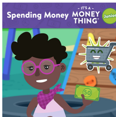
Spending Money Jr. Edition